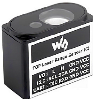
TOF Laser Range Sensor (C) 25m measuring range