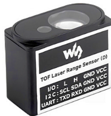
TOF Laser Range Sensor (D) 50m measuring range